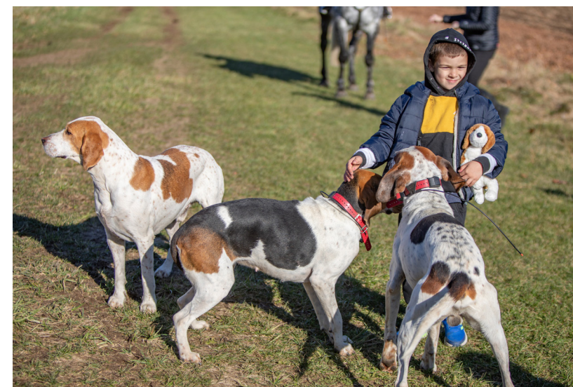
A young spectator enjoyed the attention from the Norfolk foxhounds.

Miss Peabody valued the importance of protecting the environment and natural resources and appreciated open space and nature as land for learning and passive recreation. She owned the extensive forests, streams, ponds, dams, and open areas of Noanet Woodlands, which effectively connected Mill Farm with Powisset Farm. To transverse by foot, horse, carriage, or horse-drawn sled between the two farmlands, Miss Peabody cut a wide pathway that remains a trail today and was recently used at the Amelia Peabody Memorial Hunt. It was especially important to Miss Peabody to maintain her vast properties so they could be easily accessible by foot, skis, or horseback and enjoyed by the public. The properties were beautifully maintained; extensive bridle trails were built to access new vistas and restore damage from storms. After the devastating New England Hurricane of 1938, when buildings, homes, and woods were damaged or destroyed, Miss Peabody quickly and cleverly cleared trail and built the Hurricane Alley of jumps out of downed trees in Noanet Woodlands, so walkers, equestrians, and the Norfolk Hunt Club could continue their sport. Hurricane Alley continues to be a popular trail feature today.